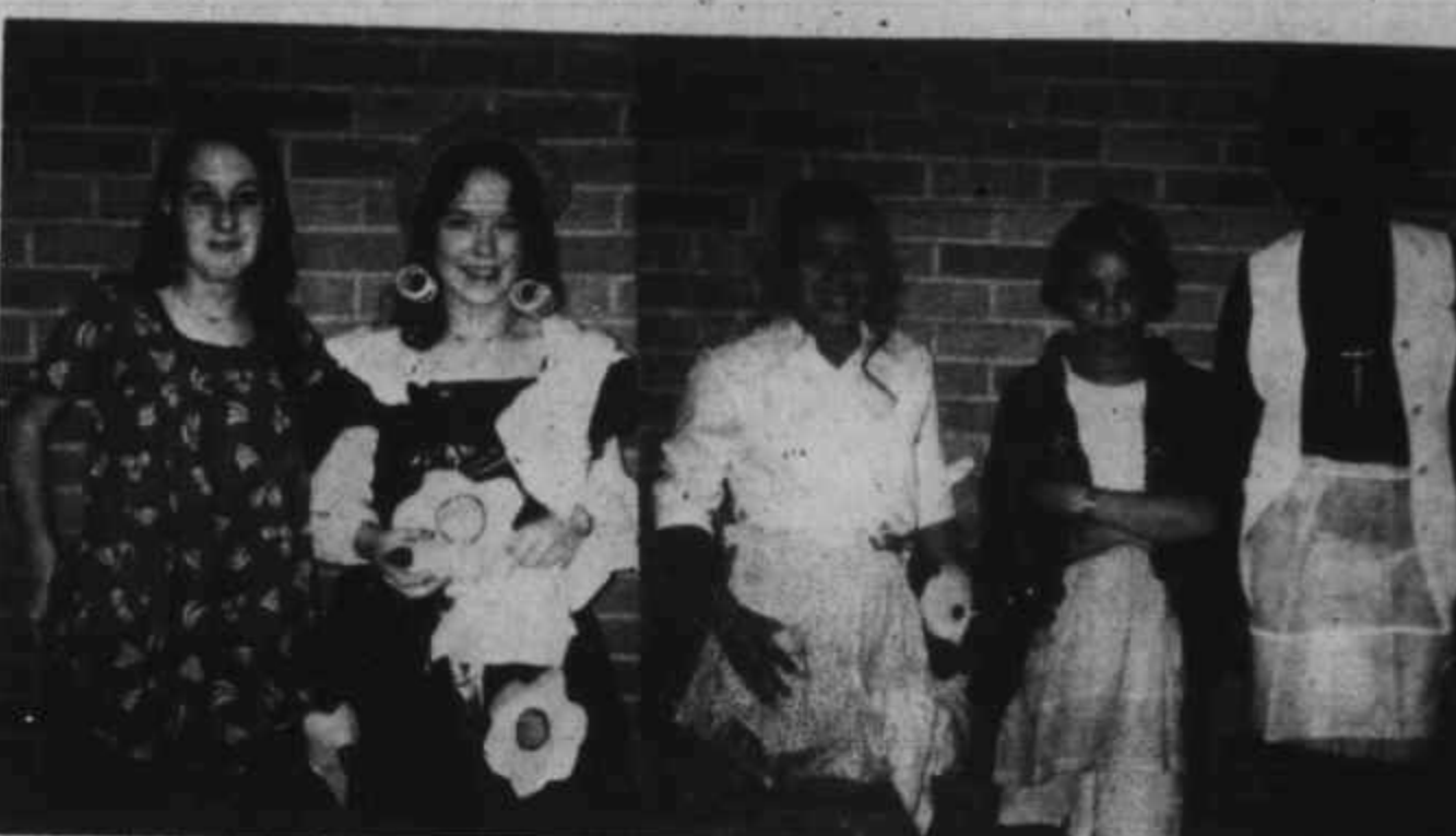
At the annual Future Homemakers of America Mother-Daughter Banquet held Tuesday evening of last week in the Rice High School Commons the five young ladies above performed in a delightful skit entitled "From May to September" recognizing mothers from the time of a new bride till